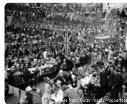
Street party to celebrate the coronation.