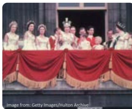
Queen Elizabeth II on her coronation.

A coronation is a ceremony where the crown is placed on the head of the new king or queen. Elizabeth II is the Queen of the United Kingdom. The coronation of Elizabeth II took place on 2nd June 1953 at Westminster Abbey, London. Many people celebrated the coronation by holding street parties.