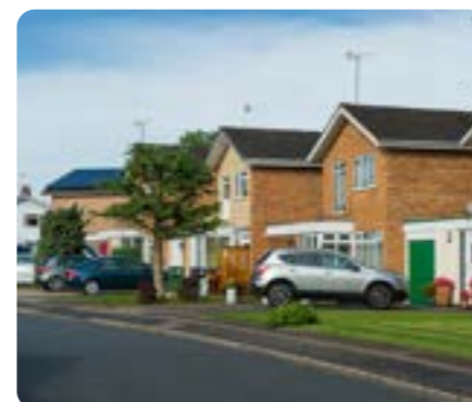
A street today.