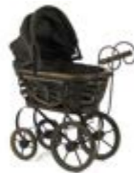
wood and metal pram