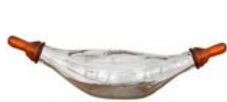
Victorian baby bottle

An artefact is an object from the past. Museums often display historical artefacts. Artefacts can tell us about how people used to live. Everyday objects like baby bottles, clothing, toys and books can tell us about childhood in the past.