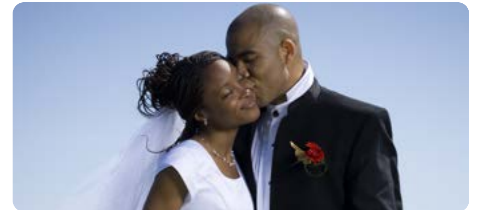
Weddings happen when two adults get married.