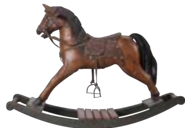
wooden rocking horse