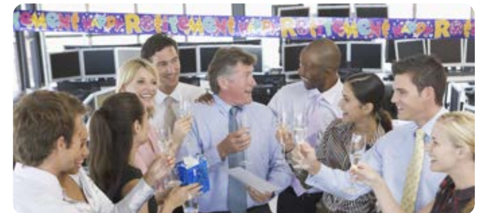
Retirement happens when an elderly person leaves work.