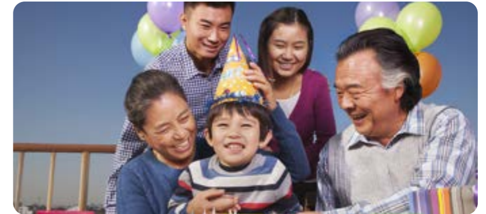
Birthdays happen every year.

Important life events include birthdays, religious festivals or family celebrations. Some life events happen every year and some happen at certain stages of human life.