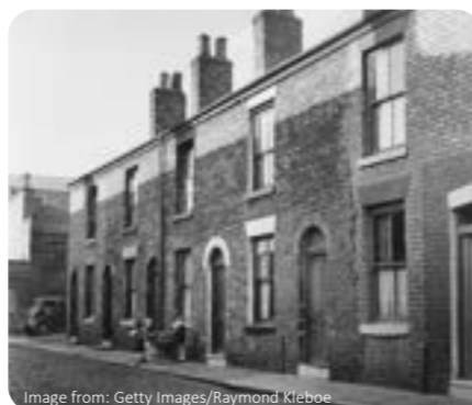
A street in the 1950s.

The way people use land changes over time. For example, in the 1950s there were fewer cars, so fewer roads were needed. Today lots of people have cars, so there are many more roads for people to drive on and driveways for parking.