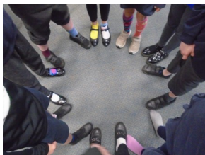
The children enjoyed wearing odd socks to support Anti-Bullying Week.