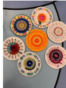
Year 4 created some amazing weaving projects in their DT lessons.