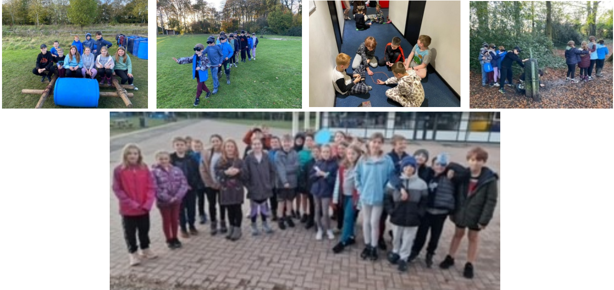
Some of the events which our Year 6 pupils enjoyed on their residential at PGL Liddington in November.